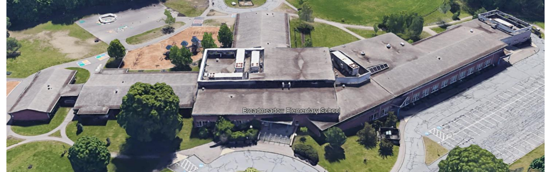
Broadmeadow has 5 RTUs