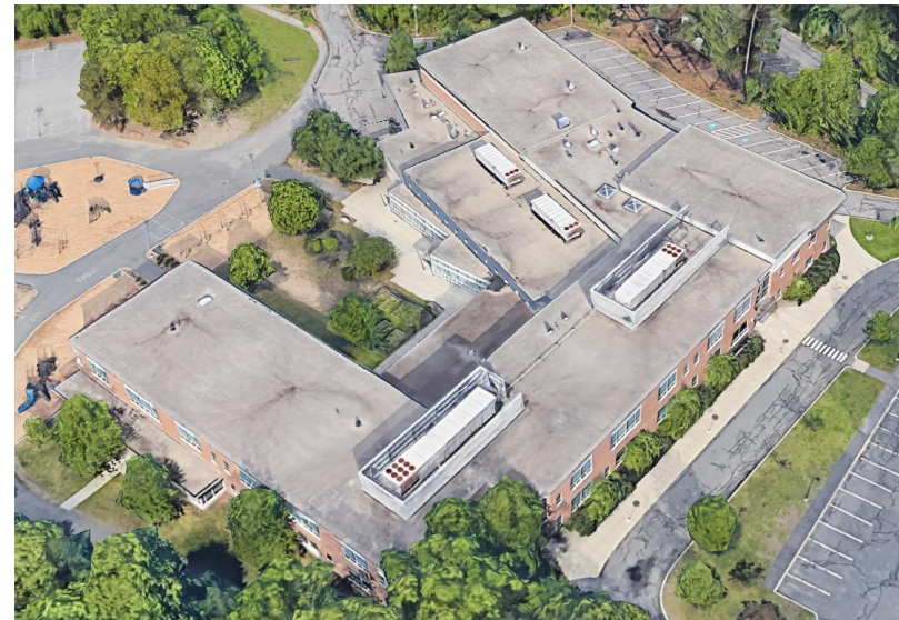
Eliot has 4 RTUs