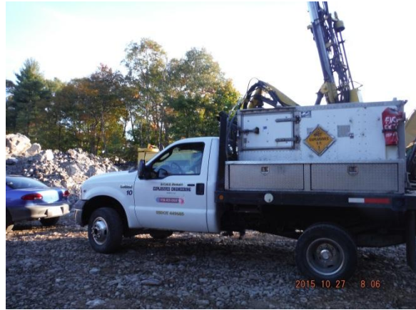
BCME Blasting on site and blasting begins 10/27/15