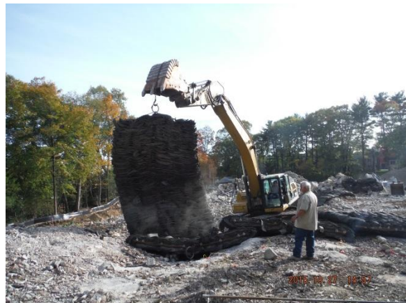
Set blasting mats 10/27/15