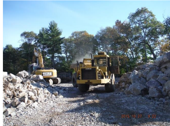
Blasted rock loaded and moved to alternate onsite location 10/26/15