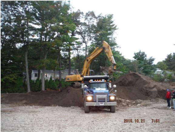
Hauling operations completed 10/27/15