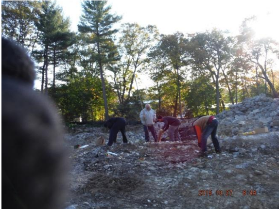
Charges being set for blasting 10/27/15