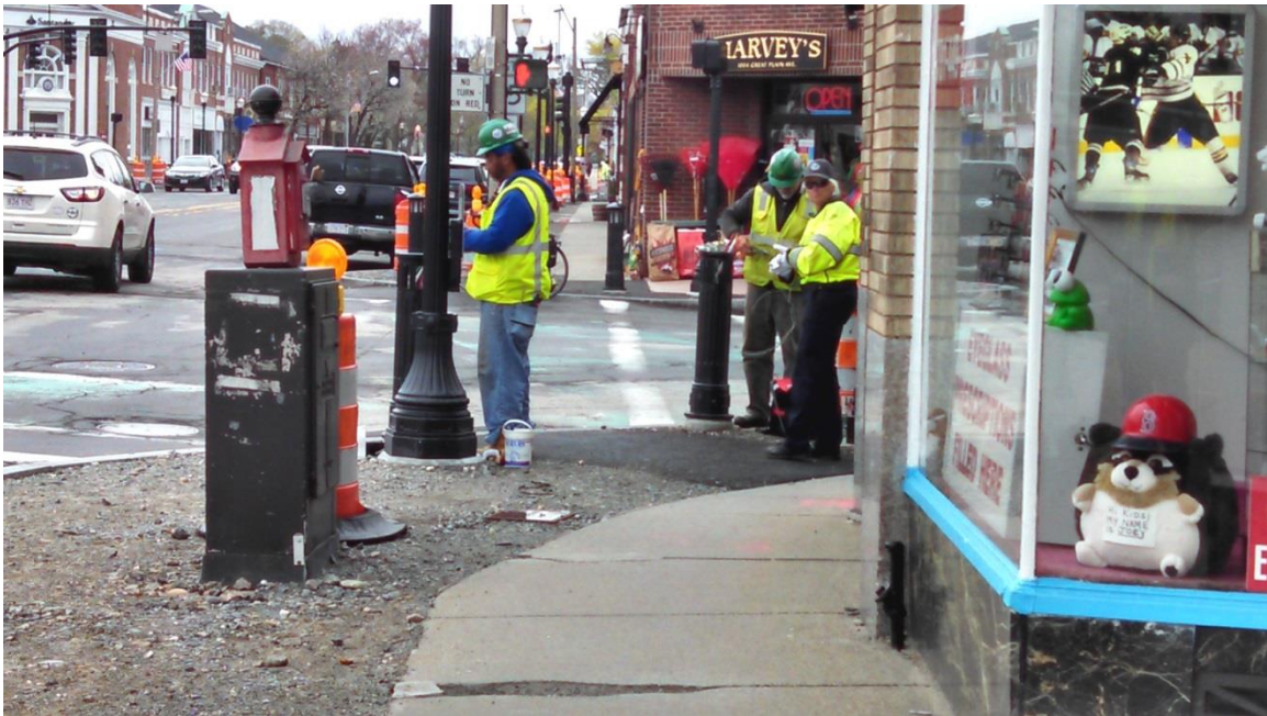
Connecting wiring to luminaires on lighted bollards on the southwest corner of Chestnut St and Great Plain Ave