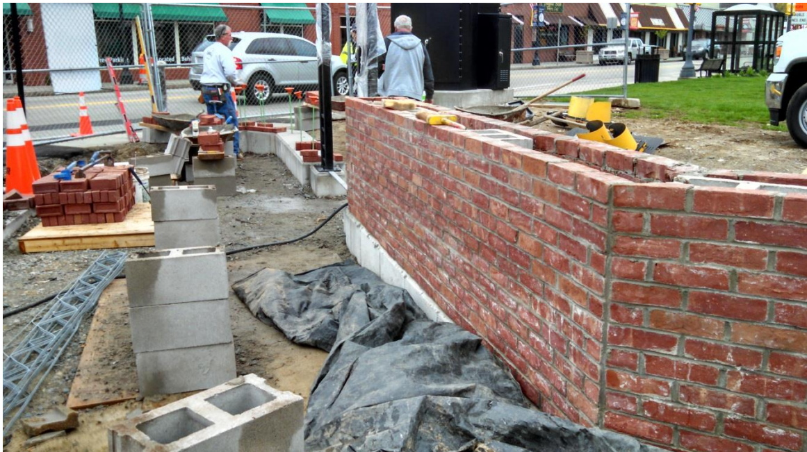
Installing brick masonry wall on the west side of the Common entrance