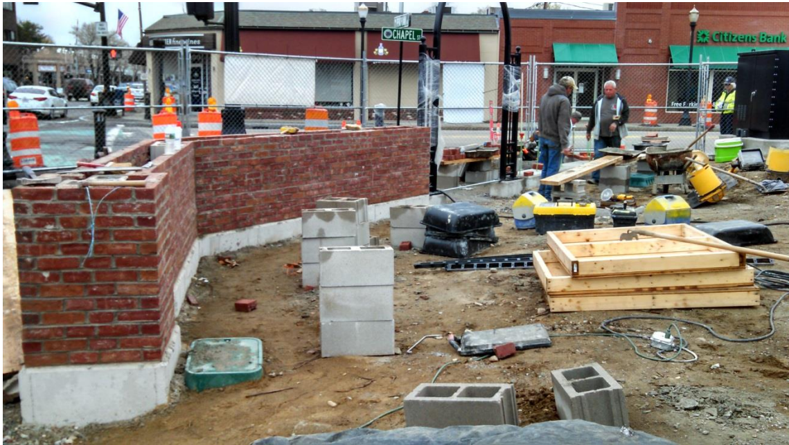
Rear of brick masonry wall being constructed on the west side of the Common entrance