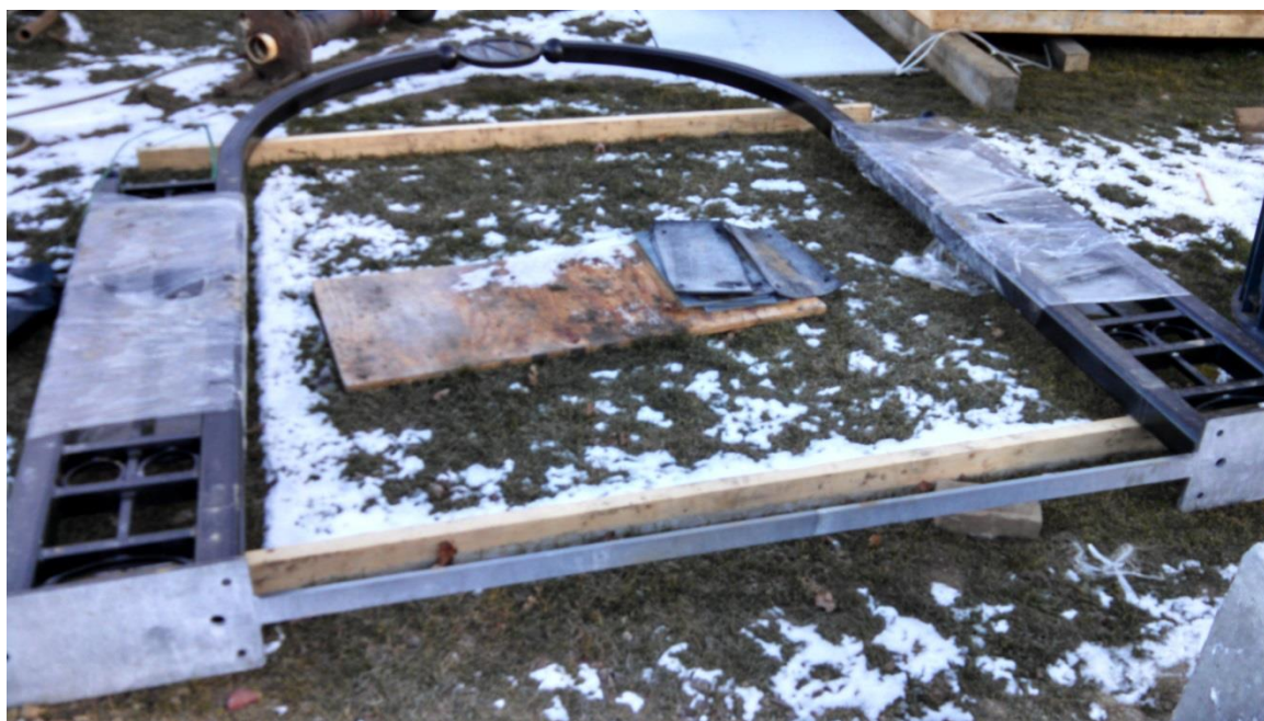
Ornamental archway ready to be installed