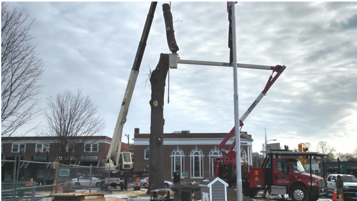
Tulip tree being removed on Common