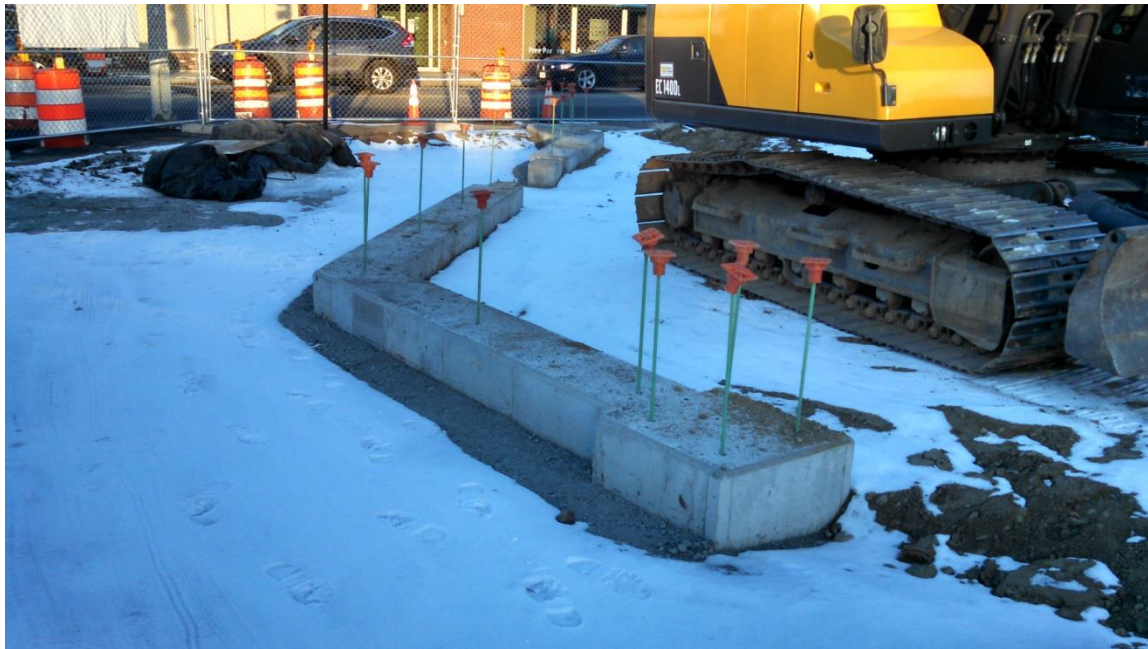
Foundation for brick wall west side of Common