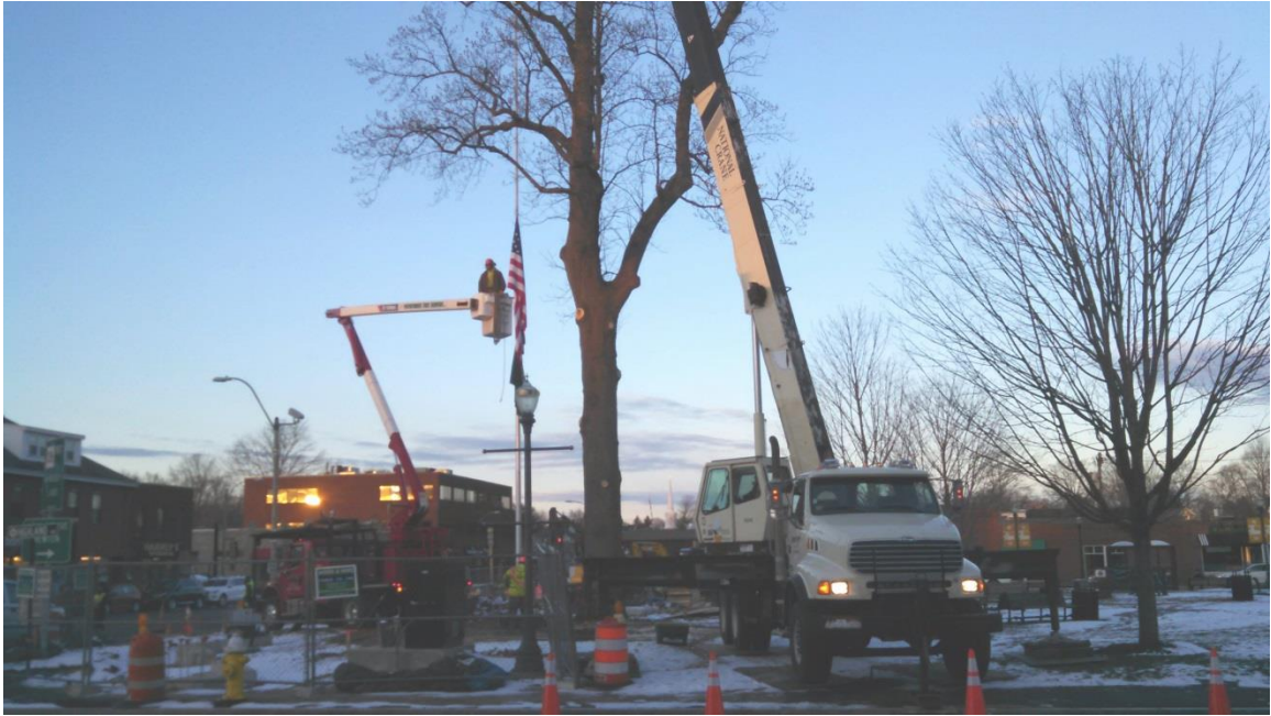
Tulip tree being removed on Common