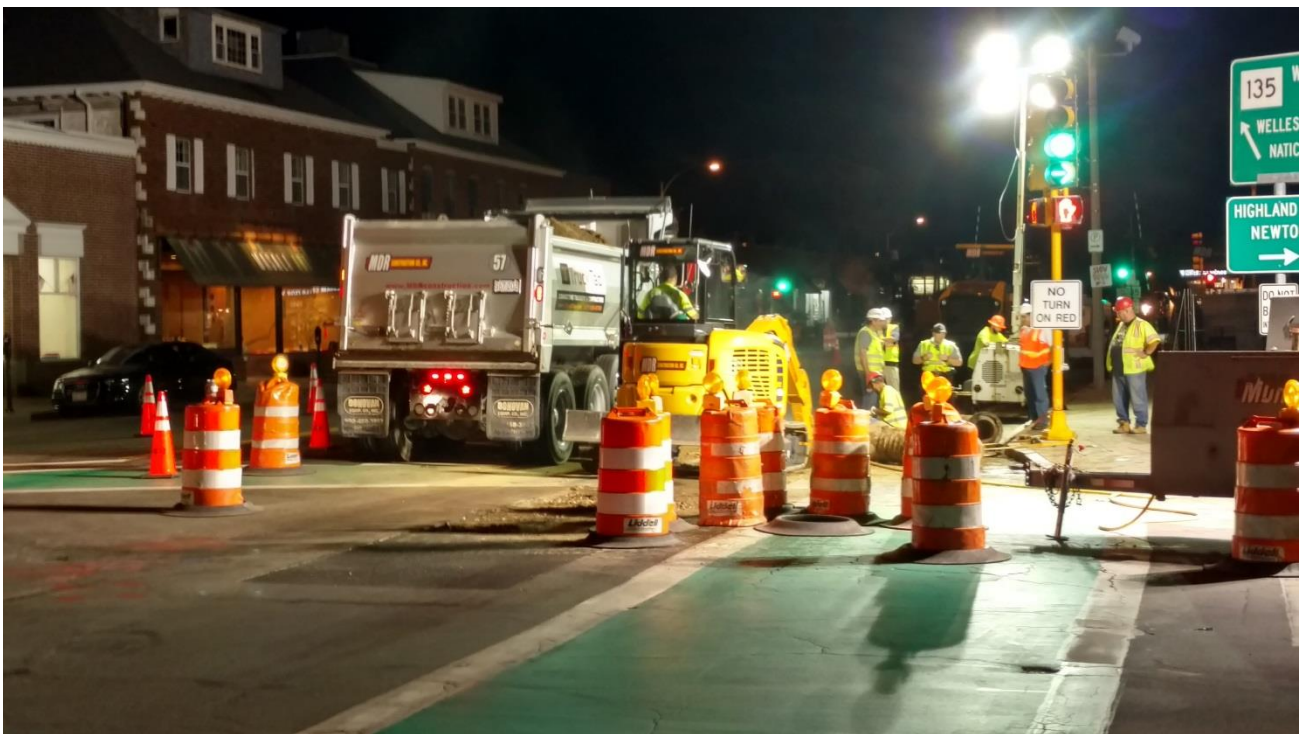
Typical crew and equipment exploring underground utilities for drainage installation